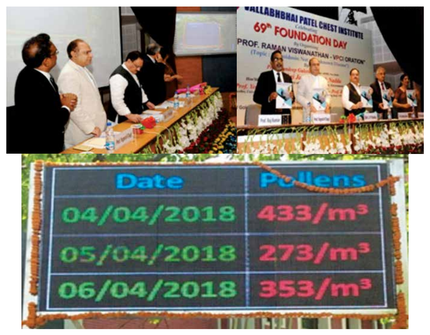
On the occasion of 69th Foundation Day of the Institute, Shri J.P. Nadda, Hon'ble Union Minister of Health & Family Welfare, Government of India, was the Chief Guest, who inaugurated the "Daily Digital Pollen Count Information for Public" installed at Gate Nos. 1 & 4 of the Institute.

A digital pollen count monitor for public, inaugurated by Union Minister of Health, Shri J.P. Nadda on the occasion of 69th Foundation Day of the Institute, has been set up at the Institute at Delhi University. Now pollen count would be displayed at the hospital gate Nos. 1 & 4 so that people who are predisposed to allergy caused by pollens can take preventive measures. The digital display board at the institute will enable people with chronic allergies to be better prepared for a dusty or pollen day on the road. It will also help create awareness about pollen concentration in the air, which is one of the major reasons for repeated attacks in asthma patients.