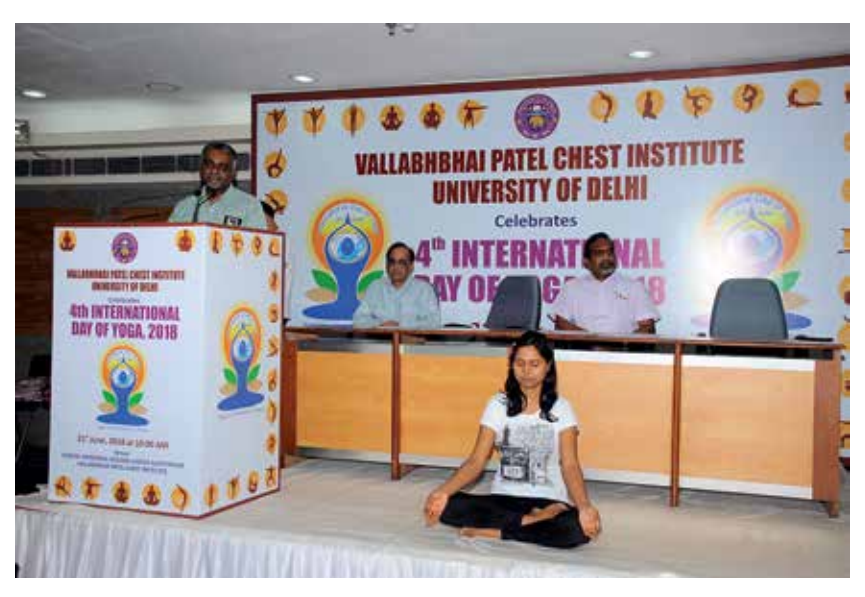
Vallabhbhai Patel Chest Institute

Yoga sessions are specially designed for the management and eradication of different health disorders, like bronchial asthma, hypertension, stress, obesity etc. The patient first reports to yoga OPD at VPCI during the period 9 AM to 3 PM, Monday to Friday to the Doctors and Yoga staff there after obtaining the case history of the patient, necessary counselling is given by the yoga ARO. Then the patient is advised to undergo yoga training and educational session according to individual's health problems for a particular period till the healing of the disease. The patient is re-examined to note the improvement made by him /her by the yoga therapist. Then patient is advised for a regular home programme with an advice to attend the training sessions once or twice a week at the Yoga Centre for better health and quality of life and to keep them healthy. Special yoga sessions for staff of VPCI are also arranged time to time.