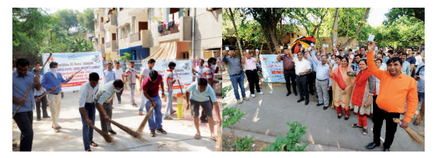
Institute observed Swachhta Pakhwada from April 1-15, 2018 and "Special Swachhta Drive – Swachhta Hi Seva" from September 15–October 02, 2018 at VPCI and its residential complexes.